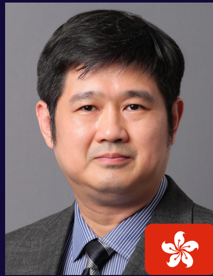
Peter Yau Hong Kong