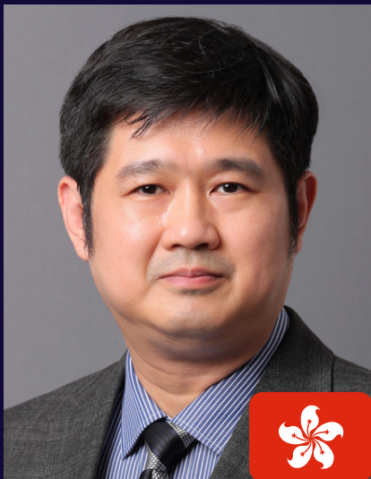
Peter Yau Hong Kong