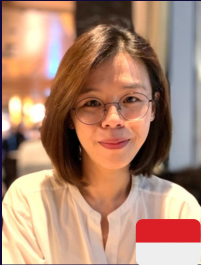
Erica Kholinne Indonesia