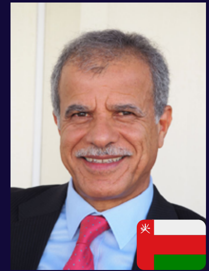
Sultan Al Maskari Oman